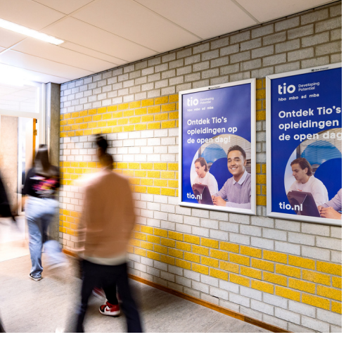
Out of Home (OOH)