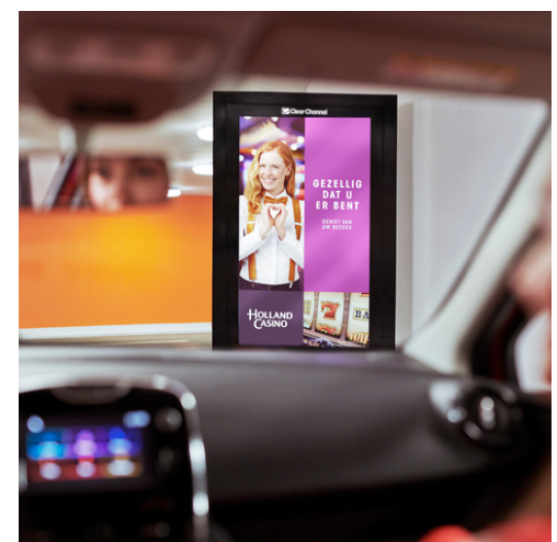
Inner City Live